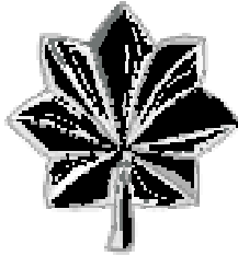
Lt. Colonel [LTC]