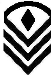
1 st Sergeant [1SGT]