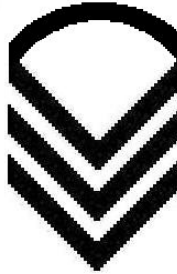
Platoon Sergeant [PLTSGT]